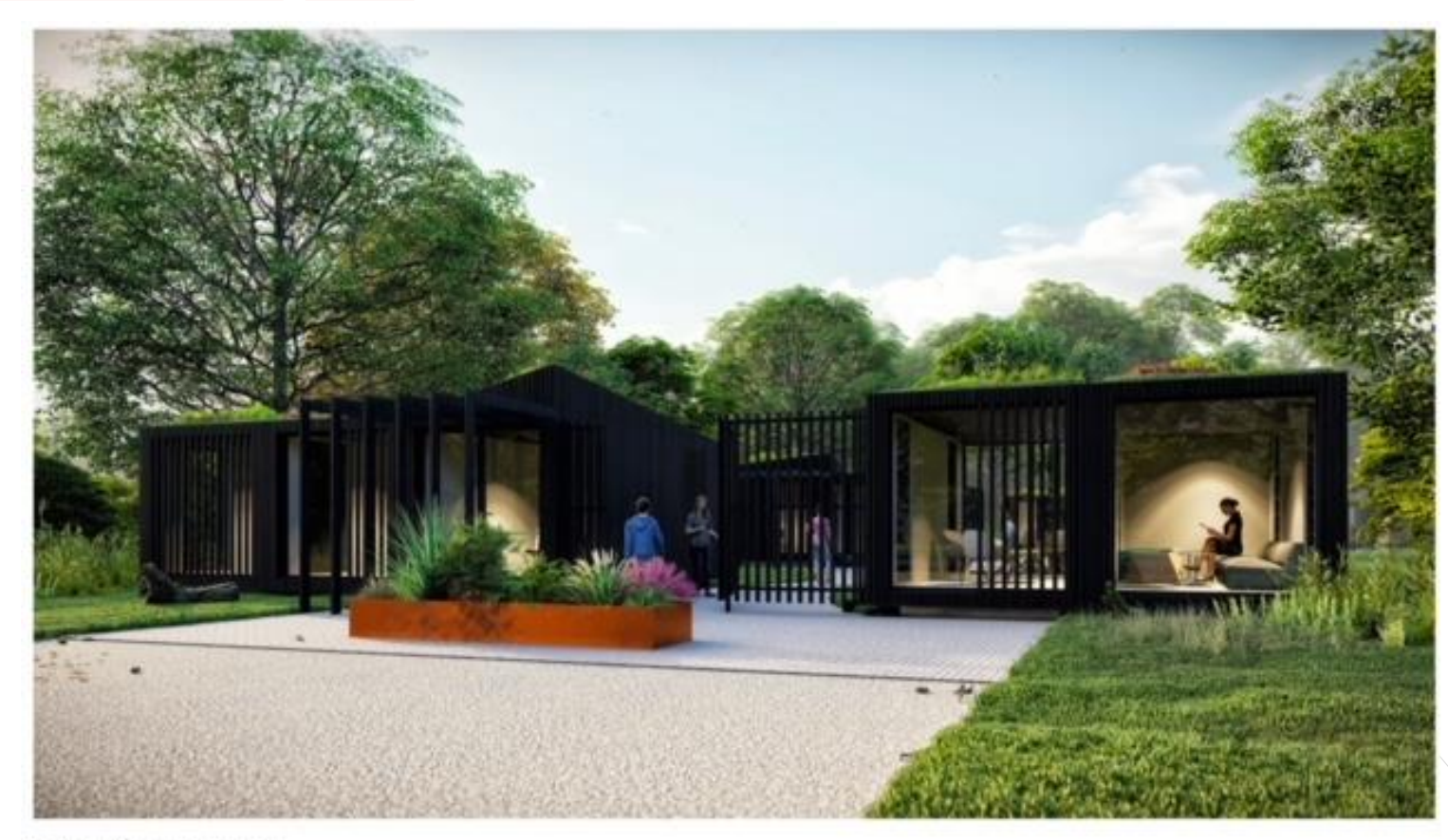
View looking North - Emission & Reception