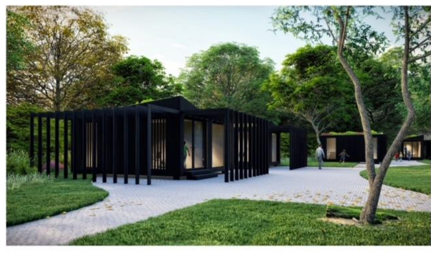
View Sooking North - Classroom Block A