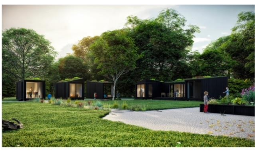
looking West - Kitchen garden, Classroom, Guiet ruson and Proyer room