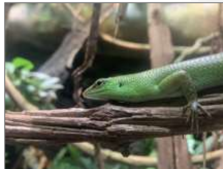
2 nd prize Sophia Smyth (8Otter)