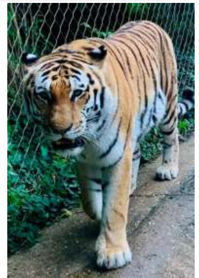
3 rd prize Emily Farnell (8Burrows)